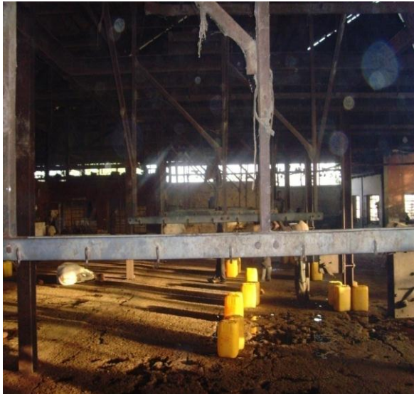
Plate III: Sokoto abattoir: vandalized rail and hoisting system which are non-functional