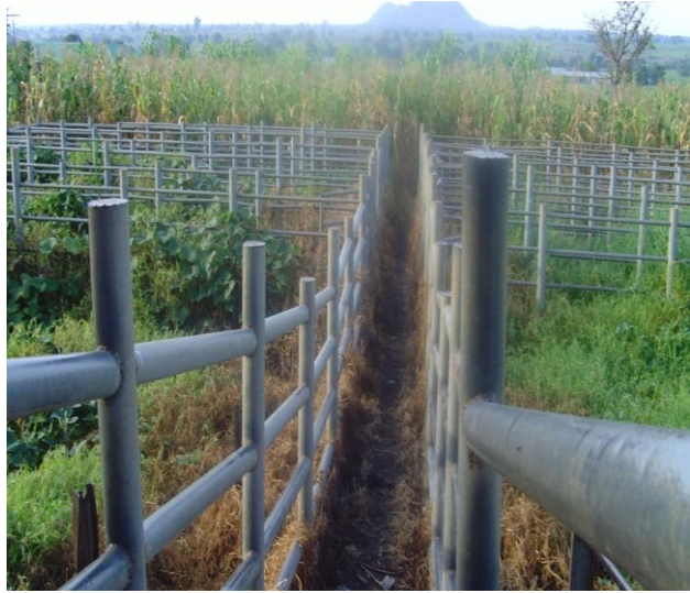
Plate II: Zango abattoir: showing non-functional lairage overgrown with plants