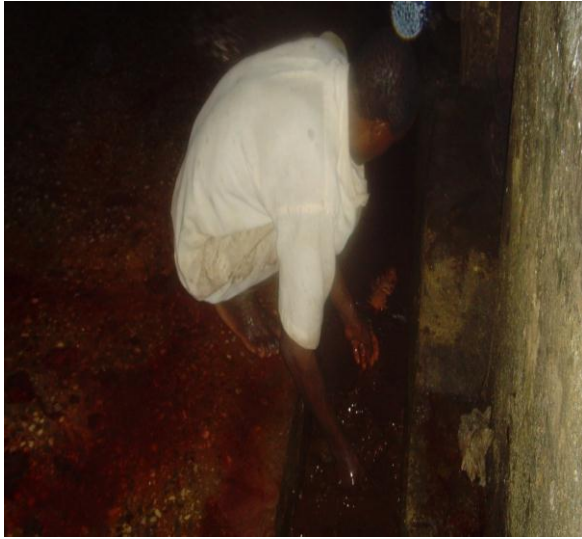
Plate I: Zango abattoir showing butcher washing meat in gutter